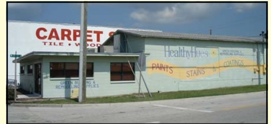
Western Exposure and Signage