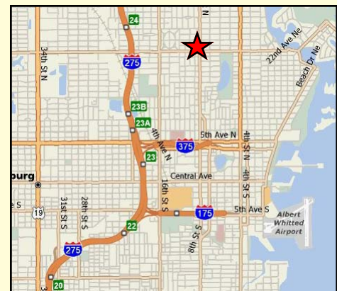
St. Petersburg, Florida

360 CENTRAL AVENUE ST. PETERSBURG, FL 33701 FAX: (727) 898-1010 WEB: WWW.OSPREYNORTHBAY.COM