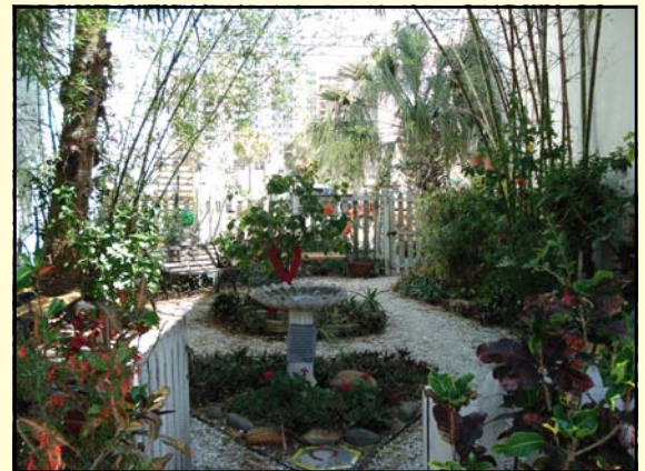
Beautiful Serenity Garden