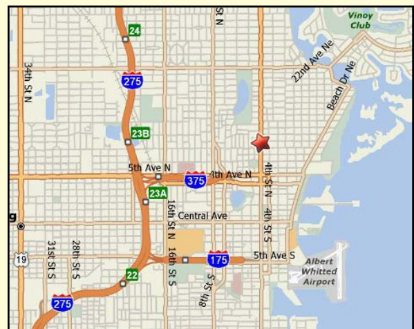
St. Petersburg, Florida

360 CENTRAL AVENUE ST. PETERSBURG, FL 33701 FAX: (727) 898-1010 WEB: WWW.OSPREYNORTHBAY.COM