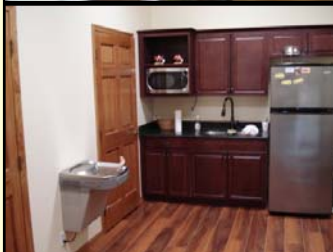
Beautiful Office and Kitchen Finishes