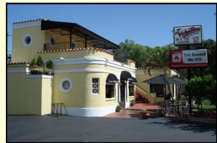
On-site restaurant and executive suite